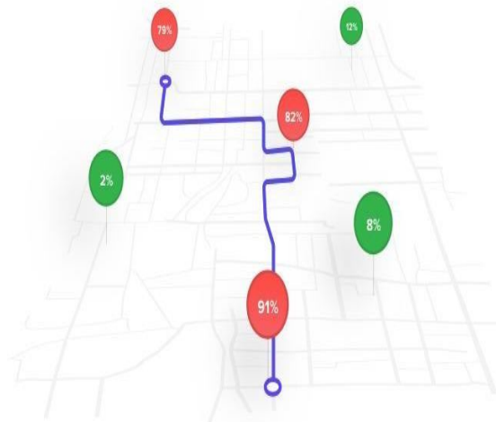
Fig 1: Tracking Optimized Path

The core of the Smart Bin System lies in its real-time waste level detection mechanism. Each bin is equipped with an ultrasonic sensor that continuously monitors the fill level of the bin. When the fill level exceeds a threshold (typically 80%), the system transmits this data via a microcontroller (such as Arduino or NodeMCU) to a centralized cloud database. A GPS module is integrated to pinpoint the exact location of each bin, enabling accurate tracking and efficient collection planning. This data is visualized on a centralized web interface for authorities to access and take appropriate action. The system ensures timely alerts, reduces overflow incidents, and streamlines the waste collection process.