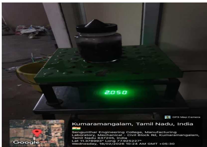
Fig.No.2: Casting of Concrete specimens