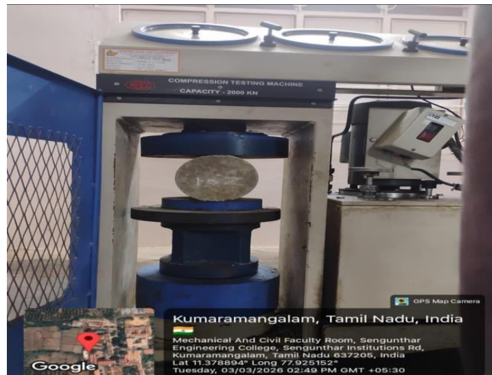
Fig No.4: Tensile Strength

Similarly, the flexural strength of the concrete beams increased with the addition of basalt fibers. The fibers improved the ductility and load carrying capacity of the concrete specimens. It was also observed that the workability of concrete slightly decreased as the percentage of basalt fiber increased. This is due to the increased surface area and interlocking effect of the fibers in the concrete mix. However, proper mixing and compaction helped in achieving satisfactory workability. Overall, the experimental results indicate that basalt fibers can effectively improve the strength characteristics and crack resistance of M20 grade concrete. Similarly, the split tensile strength of the concrete specimens showed a progressive increase with curing time. The recorded split tensile strength values were 1.71 MPa at 7 days, 2.13 MPa at 14 days, and 2.56 MPa at 28 days. The improvement in tensile strength can be attributed to the bridging action of basalt fibers, which restricts crack propagation and improves the tensile behaviour of concrete. The flexural strength test results also indicate a significant improvement in the bending resistance of the concrete. The flexural strength increased from 2.73 MPa at 7 days to 3.56 MPa at 14 days, and further reached 4.39 MPa at 28 days.