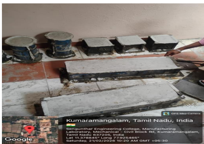
Fig.No.1: Specific Gravity Test