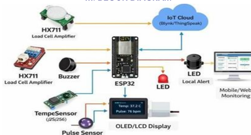
Fig: 3.1 Block Diagram

These systems consist of multiple sensors that are attached to or implanted in the human body to monitor vital parameters continuously. The collected data is transmitted through wireless communication networks to healthcare monitoring systems where doctors can analyze patient conditions. The study demonstrates that wireless sensor networks provide an effective solution for continuous patient monitoring and early detection of health problems.